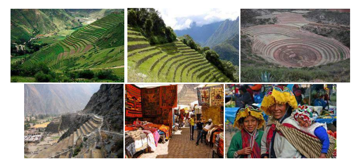
Overnight at Tambo del Inka, a Luxury Collection Resort & Spa <a href="http://www.starwoodhotels.com/luxury/property/overview/index.html?propertyID=3285&language=en">http://www.starwoodhotels.com/luxury/property/overview/index.html?propertyID=3285&language=en</a> US&localeCode=en</a> US

We will have the opportunity to share closely the peasants' customs and bargain with vendors at the typical Indian market of Pisac , held on Tuesdays, Thursdays and Sundays.