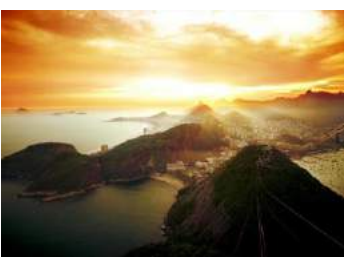
Overnight at Copacabana Palace Hotel, in Rio de Janeiro