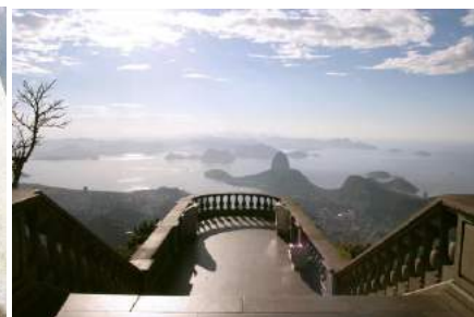
Return to the hotel in the afternoon. Overnight at Copacabana Palace Hotel, in Rio de Janeiro