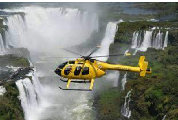
Overnight at Belmond Das Cataratas, in Iguassu Falls