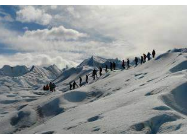
Return to the hotel in the afternoon Dinner & Overnight at Eolo Lodge, in Calafate