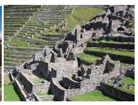
Day 14: CUSCO / LIMA