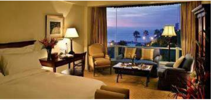
Overnight in Lima